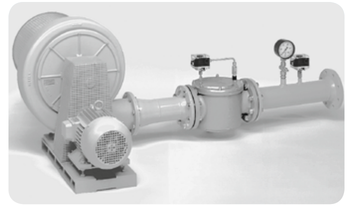
Differential pressure switch for monitoring air filters