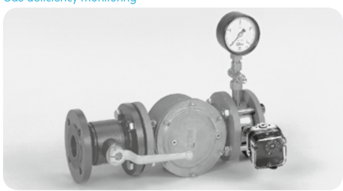
For monitoring the minimum gas inlet pressure