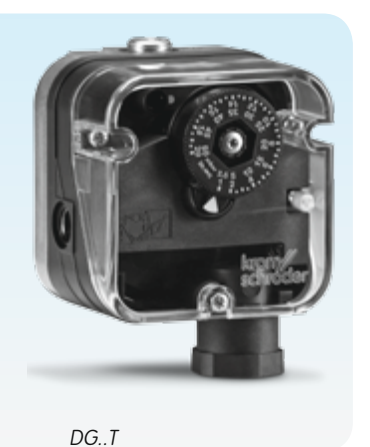
Hand wheel with "WC and mbar scale. NPT conduit for